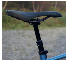
Bottom: A 70mm dropper post makes technical terrain easier

on tarmac. The Future Shock spring did creak a little when climbing out of the saddle.