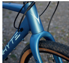
Top: The rims and 45mm tyres are tubeless ready. You could even upsize to 50mm

First up, the Specialized Diverge behaved largely as expected. The low-profile tyres offered little rolling resistance, giving a sprightly ride on the road without the drag of more heavily treaded gravel tyres. It also felt quite light, which made road miles a joy, and it climbed and cornered responsively