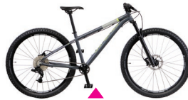
ISLABIKES CREIG 27 £999.99

Lightweight (11.6kg) aluminium hardtail with a 100mm RockShox 30 Gold RL fork, 160mm cranks, and 1x8 SRAM X4 gearing. Aimed at slightly smaller riders (ages 10+) than our test bikes.