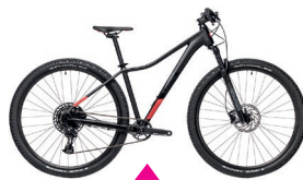
CUBE ACCESS WS SL £999.99

An XC-focussed aluminium hardtail with a steeper head angle, 100mm RockShox Judy Silver TK fork, and 1x12 SRAM NX Eagle gearing. Sizes M and L get 29er wheels, S and XS 27.5.