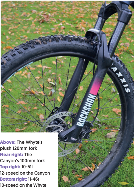
Above: The Whyte's plush 120mm fork Near right: The Canyon's 100mm fork Top right: 10-51t 12-speed on the Canyon Bottom right: 11-46t 10-speed on the Whyte

At Cycle, we are proudly independent. There's no pressure to please advertisers as we're funded by your membership. Our product reviews aren't press releases; they're written by experienced cyclists after thorough testing.