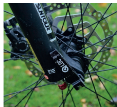
Top: Schwalbe’s Tough Tom and Rapid Rob tyres have a sensible ‘all conditions’ tread pattern but aren’t tubeless Bottom: The Q-Loc fastening offers quick and easy wheel removal without compromising wheel security

top tube and a head angle of just 64.5° put the front wheel way out front. It’s 90mm further forward than the Canyon’s, relative to the bottom bracket. This should mean much less chance of the rider diving over the handlebar. A short stem keeps the bar reach manageable; the Whyte fitted both testers well.