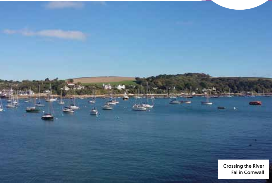
Crossing the River Fal in Cornwall