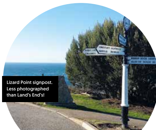
Lizard Point signpost. Less photographed than Land's End's!

The last day took us to Durness. With the wind beating us, there was no chance of being ferried across the Kyle and riding to Cape Wrath. But we were thrilled to finish our journey.