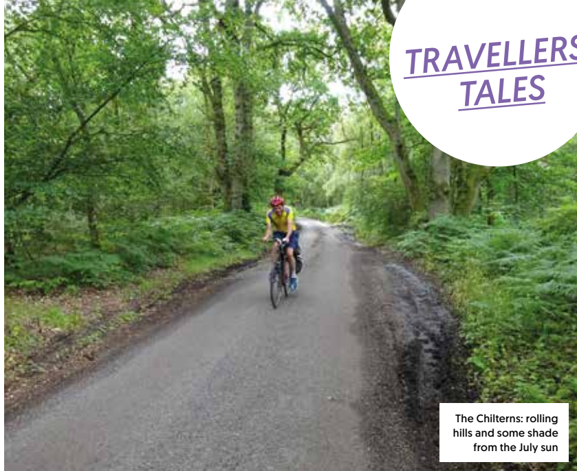
The Chilterns: rolling hills and some shade from the July sun