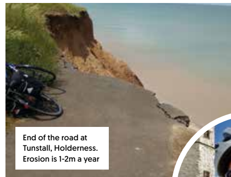
End of the road at Tunstall, Holderness. Erosion is 1-2m a year