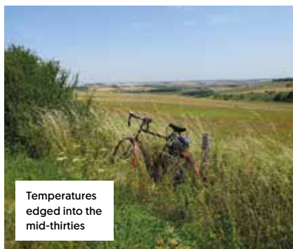
Temperatures edged into the mid-thirties

All of a sudden, the heat caught up with me. No more cockiness. After resting, I could barely get my leg over the bike. Home was a tepid bath and glass after glass of cordial. Then my wife placed me gently into the recovery position: stretched on the armchair with tea to drink and, just a fingertip away, a man-sized slab of cake. I would live to pedal another day.