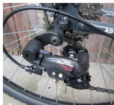
Above: The Tourney derailleurs shift well but the gearing is too high for loaded touring due to a 50-34 double

It is generously kitted out, with front rack bosses, a rear rack (complete with spring-loaded briefcase retaining clip), mounting bosses for three water bottle cages, mudguards of a decent length, and a saddle with copper rivets, albeit for decoration. It even has frame lugs – at least on the head tube and seat cluster; the less noticeable bottom bracket area is merely TIG-welded. Yet on a properly