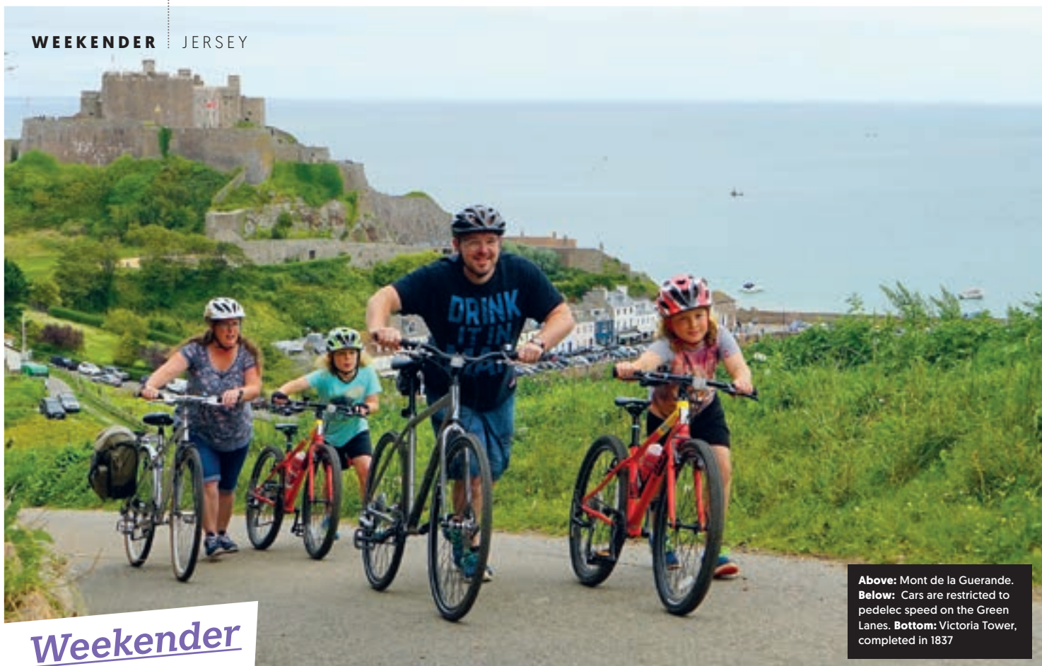
Above: Mont de la Guerande. Below: Cars are restricted to pedelec speed on the Green Lanes. Bottom: Victoria Tower, completed in 1837