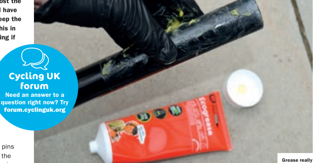
is the word

The manufacturer's stated torque figure for the clamp screw should be respected, as exceeding it may strip the thread or shear the screw. Torque settings are common on the lightweight fasteners used on some of today's high-performance components. As your recollection of what 7Nm feels like was slightly low – subsequent increases apparently failed to strip or shear anything – then consider using a suitable torque wrench to ensure correct assembly. Richard Hallett