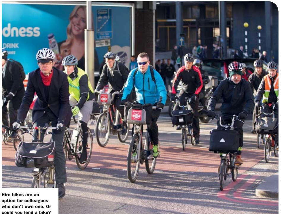
Hire bikes are an option for colleagues who don't own one. Or could you lend a bike?

Backpacks are okay for short trips but luggage on the bike means less sweat