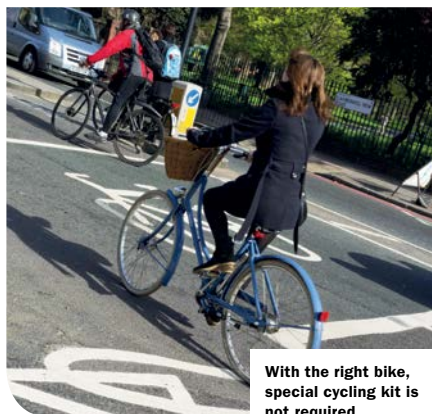
With the right bike, special cycling kit is not required

By subscribing to the Government's Cycle to Work Scheme, an employer can buy a cycle for an employee and hire it to them for a regular payment, usually over a year. If they want, the employee can buy the bike at the end of the loan period at market value. It's tax-efficient because payments are deducted from wages before tax, typically saving an employee at least 25% of the cycle's cost. ➤