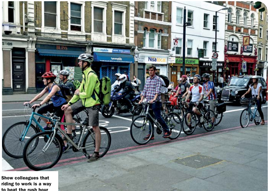
Show colleagues that riding to work is a way to beat the rush hour