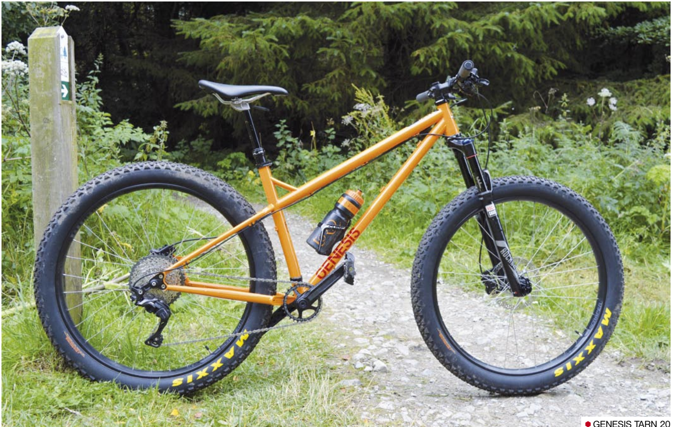
● GENESIS TARN 20

the chainstays are just 420mm, shorter than most mountain bikes with any size wheels.