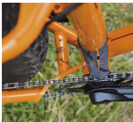
● (Above) The Tarn employs a belt-and-braces approach to keeping the chain on: a RaceFace narrow-wide chainring plus a Yung Fang CD-04E chain keeper

» I won a cyclocross race on 29+ tyres! Bigger tyres aren't a like-for-like replacement for telescopic suspension. They can't soak bigger bumps or repeated hits like well-tuned shocks, so if you like hammering down rocky trails at speed, you'll be faster on full-suspension. Yet the Trek Stache 7 29+ and the Genesis Tarn 20 are capable enough for most riders' needs.