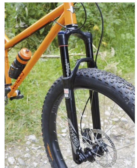
● (Above) This Boosted RockShox Reba is designed for a 110mm-axle 29er wheel but fits a 650B+ just fine. The Tarn's hub is a standard one with spacers to make it fit the wider fork – a strange economy on a near £2k bike

The Tarn 20 comes with a dropper seatpost and, like the Trek, has frame guides for a remote dropper should you wish to