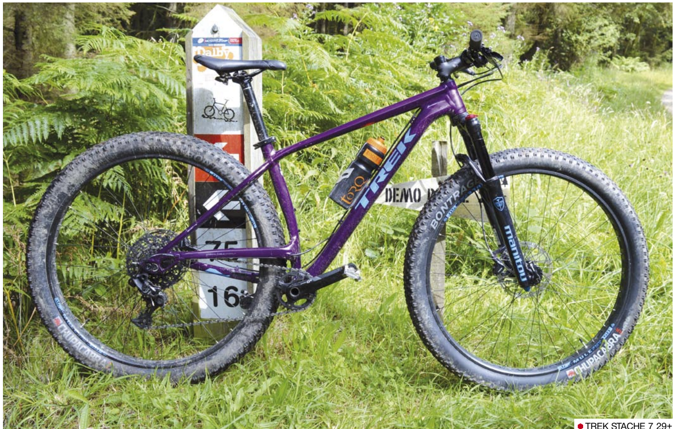
● TREK STACHE 7 29+