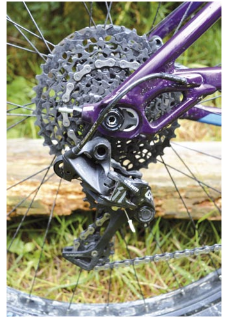
● (Left) Trying not to run over the self-timer camera on Dalby Forest's World Cup course (Above) 'Stranglehold' dropouts provide 15mm of fore-aft adjustment, in theory to accommodate 29er or 650B+ wheels too