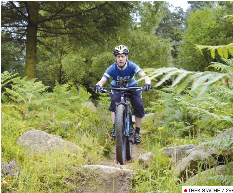
● TREK STACHE 7 29+