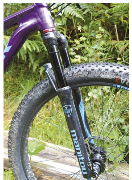
● (Above) This is the OEM-only Comp version of the Manitou Magnum 34 fork. The Stache 5 has a rigid carbon fork instead, while the Stache 9 gets a Manitou Magnum 34 Pro fork, which has an improved air spring and better compression damping than the Comp

The Trek Stache 7 29+ looks more like a project bike designed to turn heads at trade shows than a production bike from a mainstream brand. The chainstays are so short that the 30T chainring overlaps the wheel. There's no chainring/chainstay interference because the drive-side chainstay doesn't swoop out to clear the enormous tyre. It's been lifted out of the way, using an elevated chainstay reminiscent of the 1990s. More space is saved by sacrificing the front derailleur. As a result,