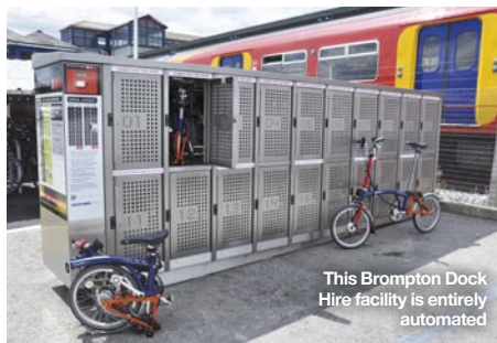
This Brompton Dock Hire facility is entirely automated