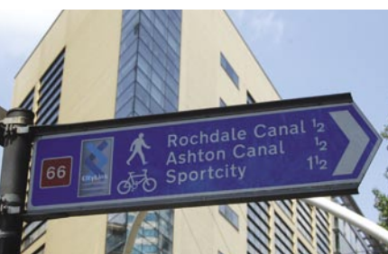
(Above) A handy cycle route alongside the Manchester Ship Canal (Below) 'Sportcity' is where you're headed; it's next door to the velodrome

Velodromes are thin on the ground in Britain and this one is certainly worth a visit. If you feel like a bike ride within a bike ride, there's a very reasonably priced track taster session for beginners (£10, including tuition and track bike rental). Book ahead, though. These tasters have become very popular since Hoy, Wiggins, Cavendish, Pendleton and Jones took to the world stage.